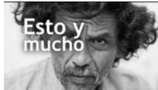
Cine Con Sentido Un Mundo Sin Toledo