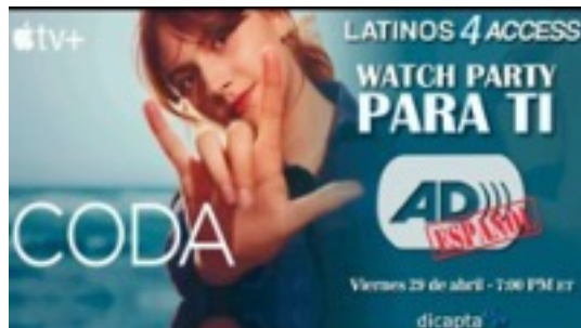
Watch Parties-Para Ti - CODA

Check out some of the activities of this quarter (April-June 2022) .