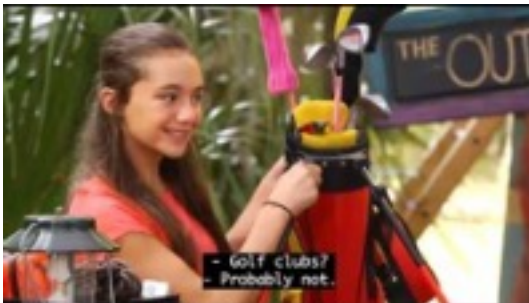
Crawford Entertainment. The Outsiders Club

Check out the following video clips that are samples of the programming produced during this quarter under the Television Access H327C210001 project.