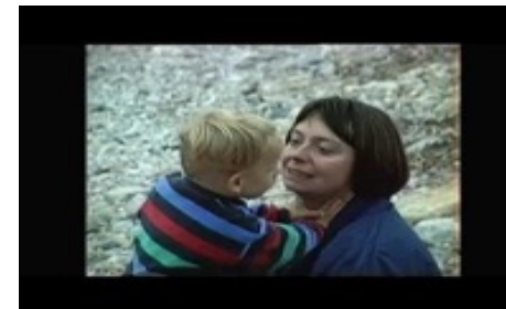
POV. He is my brother